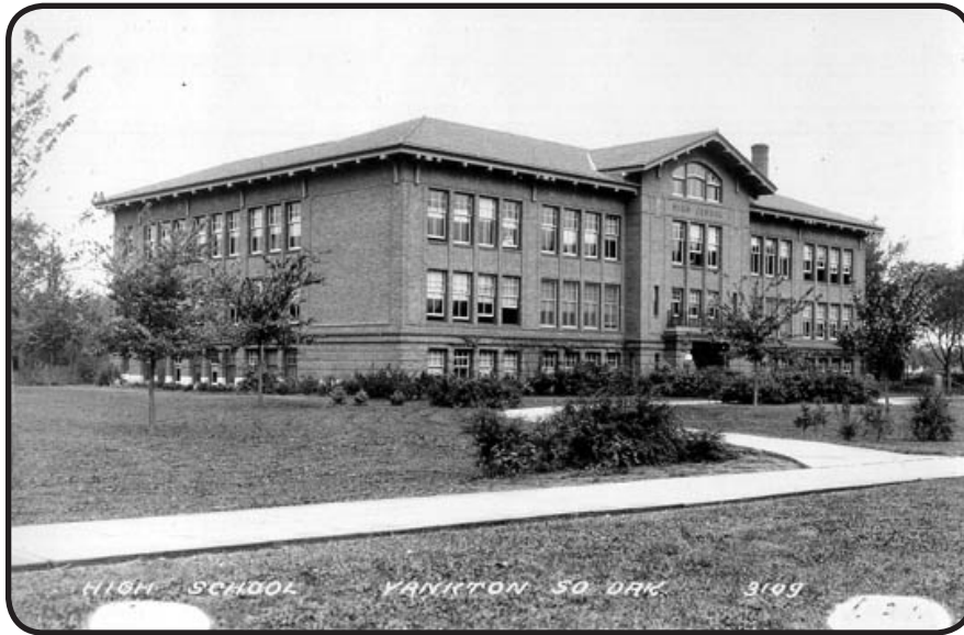
Yankton High School