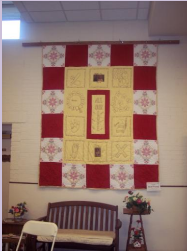
Heidi Tramp's Quilt Is on Display In the Dining Room